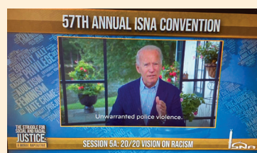
President-Elect Joe Biden Message for the 57th ISNA Annual Convention

“Powerful and comprehensive discussion — Thank you for your leadership in the community.” Event Attendee